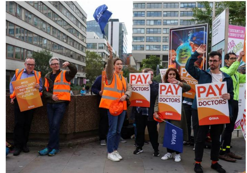
Health workers protest on a picket line as junior and senior doctors in England take part in a joint strike action for the first time, outside St Thomas's Hospital in London, Britain September 20, 2023. REUTERS/Susannah Ireland/File Photo Acquire Licensing Rights

We are working with system partners to ensure plans are in place keep services safe during these further periods of industrial actions.